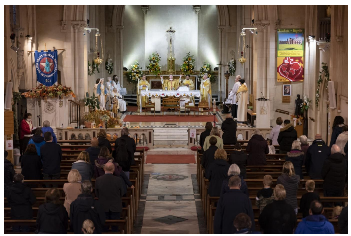
Jubilee Mass 31st October 2021